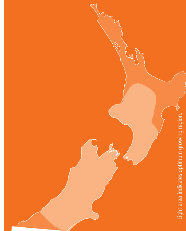
Light area indicates optimum growing region.